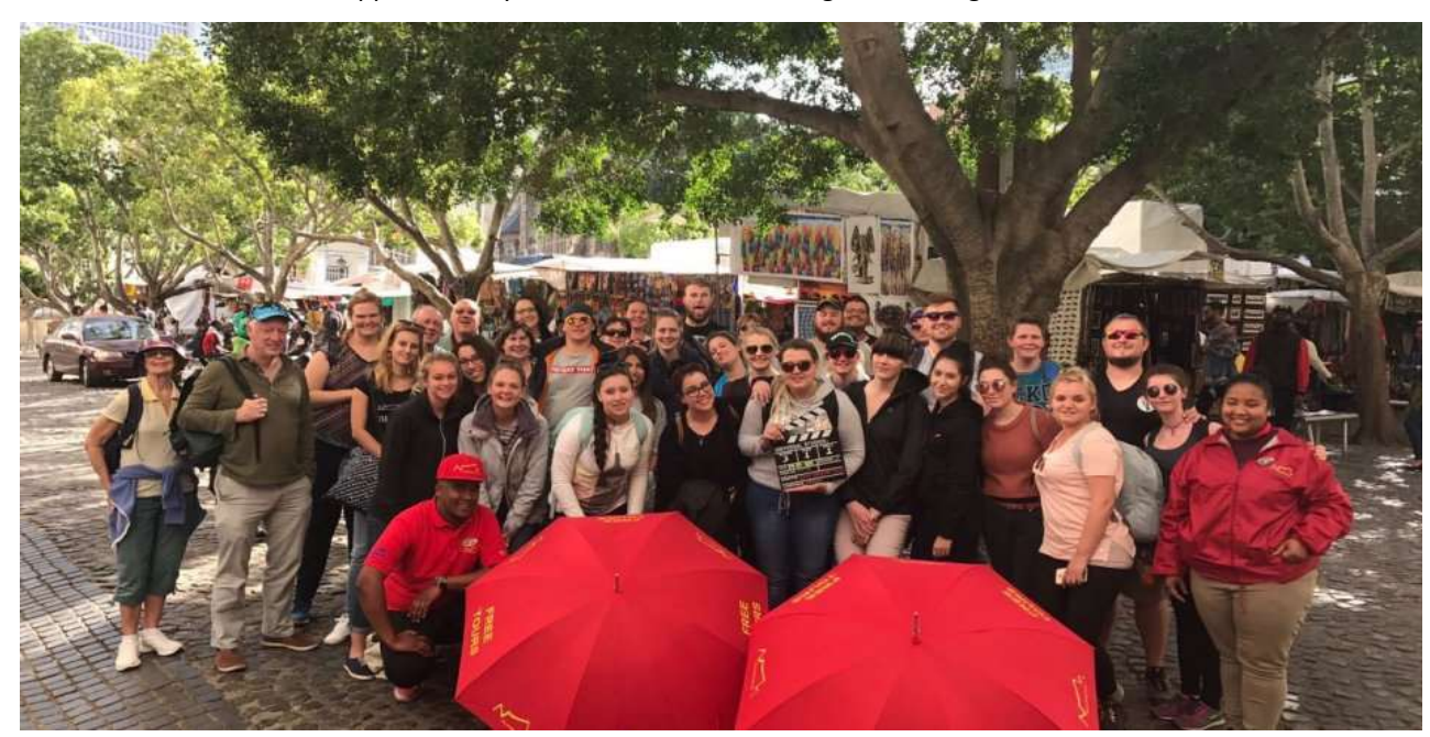
What to wear and bring: You'll be walking the streets of Cape Town, some cobbled, so wear your comfiest pair of shoes and make sure your camera is fully charged to capture the charm of the city.

Total tour duration: all tours take approximately 90 minutes. All tours are guided in English