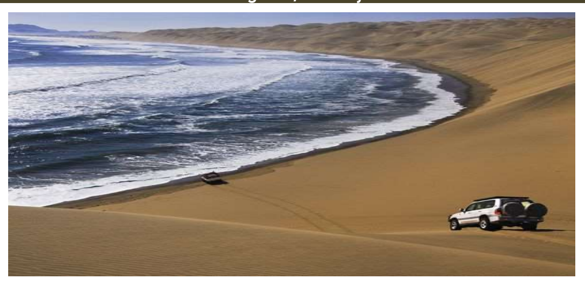
Windhoek + Namibia to Victoria Falls + Zambia + Namibia + Botswana + Zambia